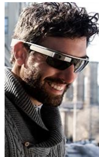
Above photo by Google